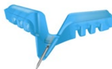
23G30mm 23G50mm 23G70mm