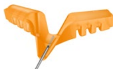
25G40mm 25G50mm 25G60mm