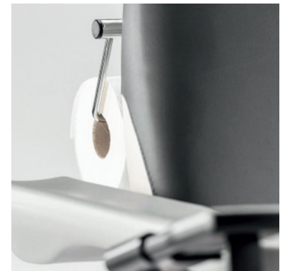
Paper roll holder