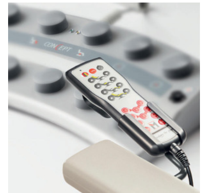
Hand and foot control