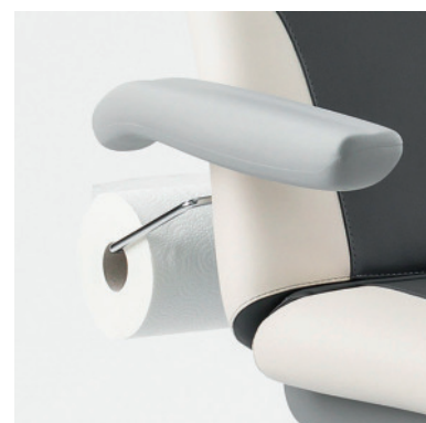
Paper roll holder