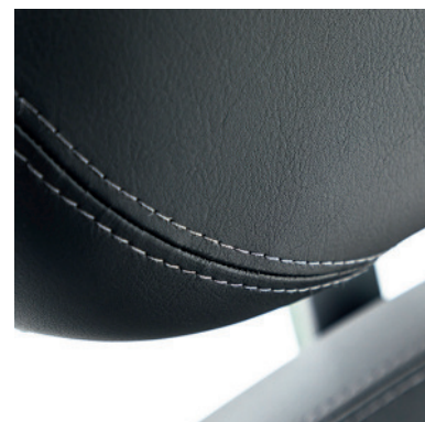
Various cover materials